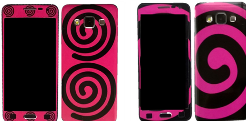
Fig. 2. Smartphone designs used in Study 2.